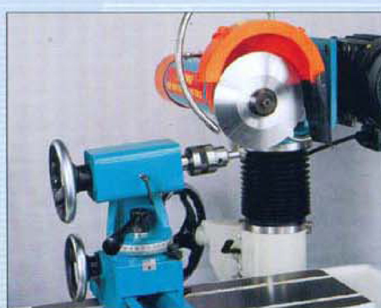
● ROUTER BIT ATTACHMENT