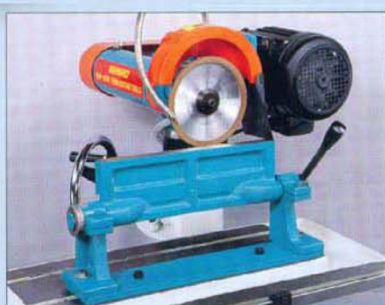
● PLANING KNIFE ATTACHMENT