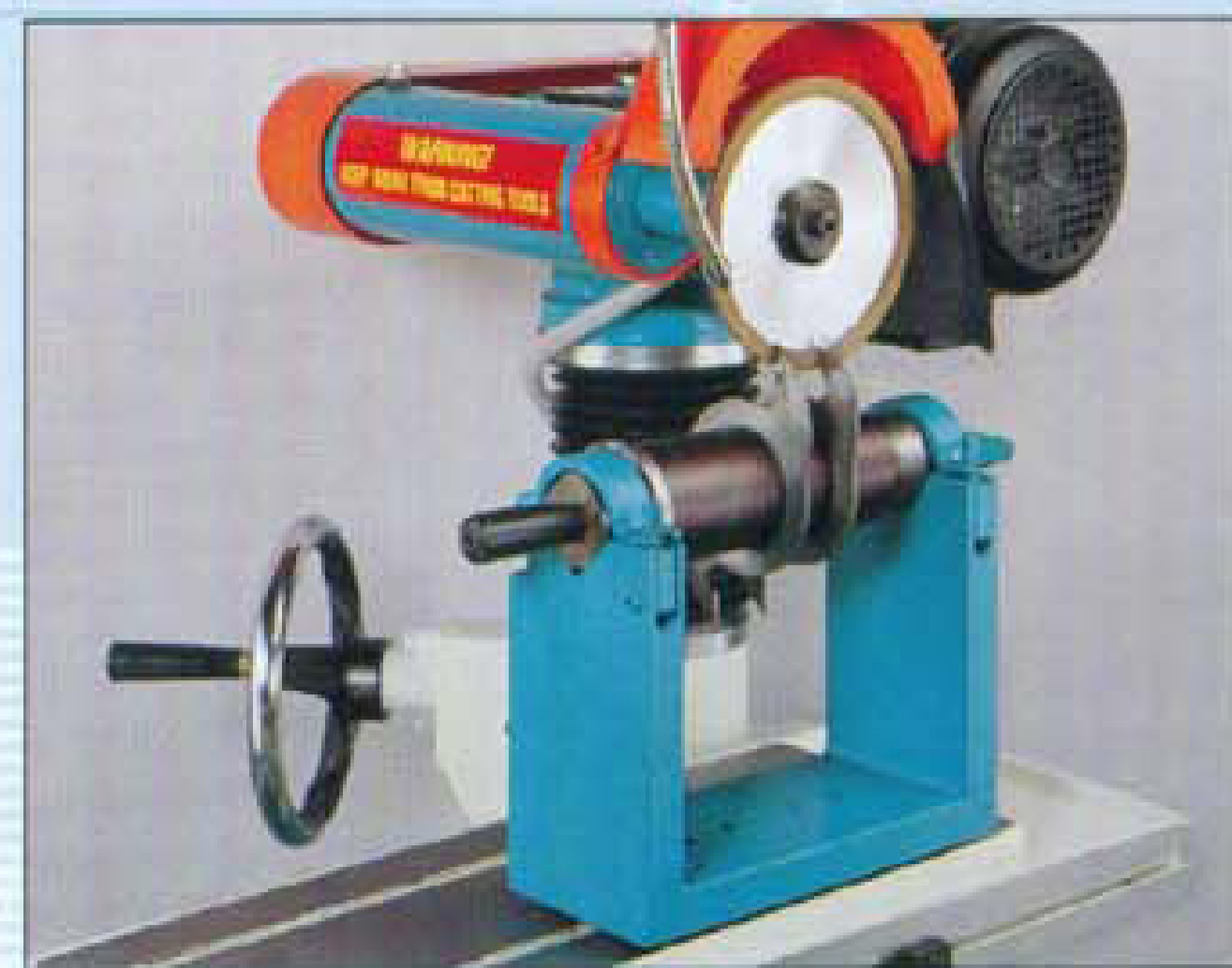
● FINGER CUTTER ATTACHMENT (OPTIONAL)