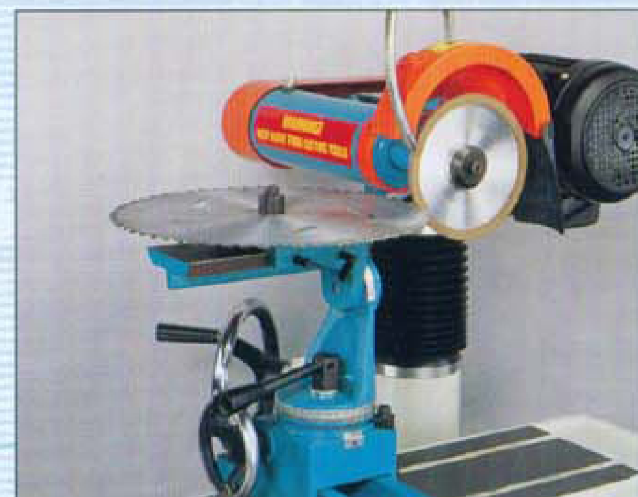
● SAW BLADE ATTACHMENT