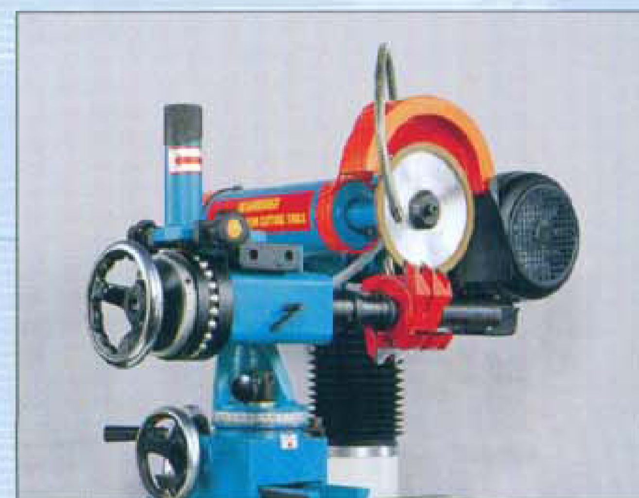
● CUTTER ATTACHMENT